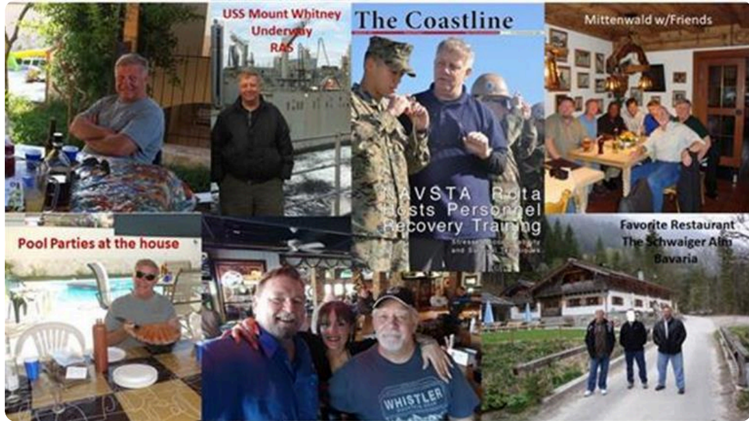
Warrior Monk, Husband, Father, Mentor, Friend and Brother